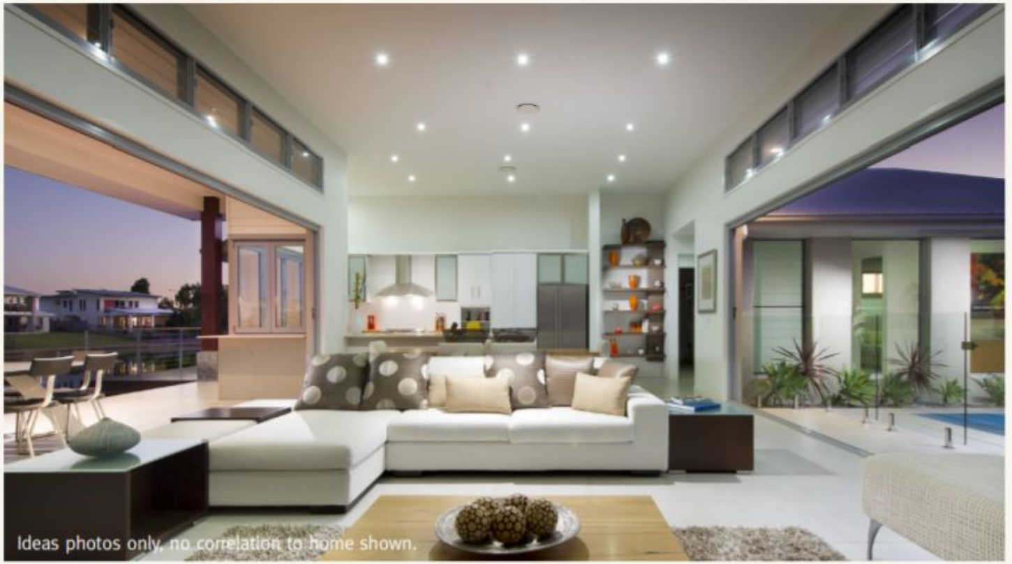
Ideas photos only, no correlation to home shown.