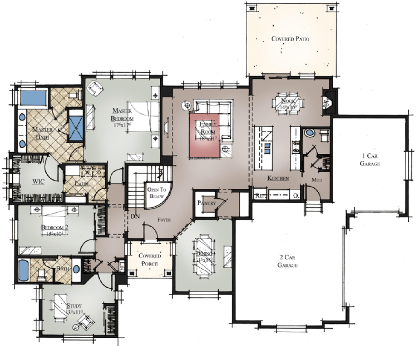
MAIN FLOOR PLAN 0' 4' 8'