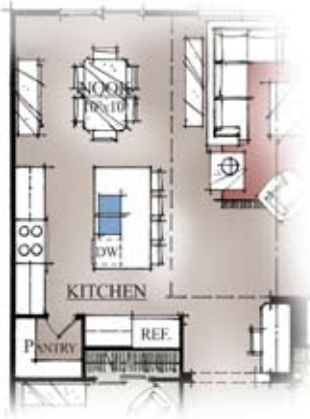
OPTIONAL VALUE KITCHEN