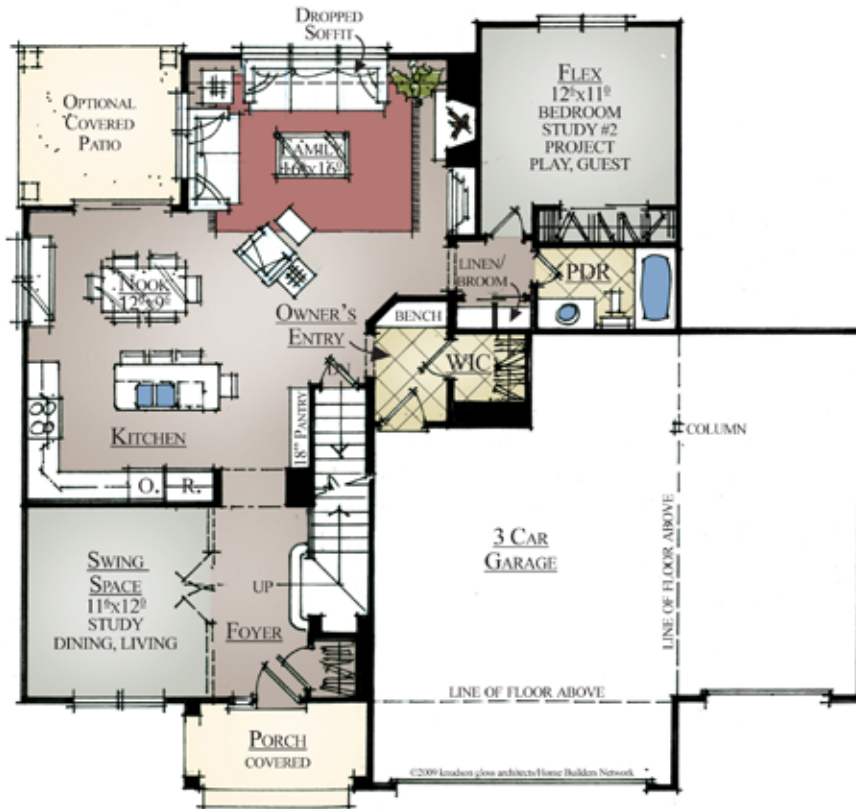
MAIN FLOOR PLAN 0' 4' 8'